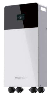
Fidus Battery Plus